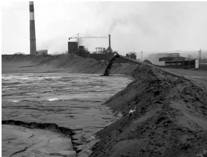
Figure 10.1 Depositing sulfidic mine tailings as slurry on top of the tailings dump (ore processing plant in the background).