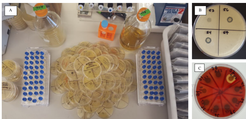
Figure 4. A. Isolates of Burkholderia and Ralstonia species cultured from the ISS potable water system. B. Select isolates display the ability to inhibit Aspergillus species ( Burkholderia demonstrate zones of inhibition when spotted on agar also growing Aspergillus sp.). C. Select isolates also exhibit the ability to lyse red blood cells as demonstrated by spotting the cultures on sheep's blood agar plates.

In some bacteria, the microgravity environment can affect bacterial virulence, resulting in altered pathogenicity (C. A. Nickerson et al., 2004). For instance, members of Salmonella enterica have demonstrated increased virulence when grown under modeled microgravity simulated using a high-aspect rotating vessel (C. a Nickerson et al., 2000). Whereas, S. aureus grown under similar modeled microgravity conditions show an increase in the transcript levels of genes involved in biofilm formation but