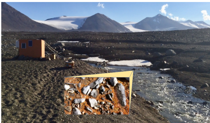
Figure 3. A gauge box set up by the Long-Term Ecological Research team to monitor water stream chemistry and hydrology of Von Guerard stream in the McMurdo Dry Valleys. Image zoom is of the cyanobacteria mats that are found in the meltwater streambeds.

Don Juan Pond (DJP) is an ice-free hypersaline pond located in the Wright Valley of the MDV. It is one of the saltiest bodies of water on Earth, comprised of 40% salt by weight. Salt in DJP is primarily (>90%) \text{CaCl}_2 (Toner, Catling, and Sletten, 2017). The high salinity ensures that the pond remains unfrozen, during the austral winters, at temperatures below -50^\circ\text{C} (Marion, 1997). The input sources for the pond are widely debated in the literature. Arguments have been made for the upwelling of a deep groundwater flow system that replenishes the brines, and also for the deliquescence of salts in the shallow subsurface (Dickson et al., 2013; Nuding et al., 2014; Toner et al., 2017). Deliquescence is the process in which salts absorb atmospheric moisture at a critical relative humidity. The salts then dissolve in the absorbed water resulting in the formation of an aqueous brine (Nuding et al., 2014). Many studies on RSL suggest deliquescence as the formation mechanism for the darkened slope streaks (Dickson et al., 2013; Gough et al., 2017). Laboratory studies on DJP salts suggest brines on Mars could be rich in \text{CaCl}_2 given the melting temperature of the mixture. The unique geochemistry of this system is an important analog to the Martian subsurface and may provide clues in the ongoing investigations of RSL (Dickson et al., 2013; Mikucki et al., 2006).